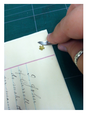
Archivist Joyce Phelps works to remove a grommet, a type of paper fastener, from a document.