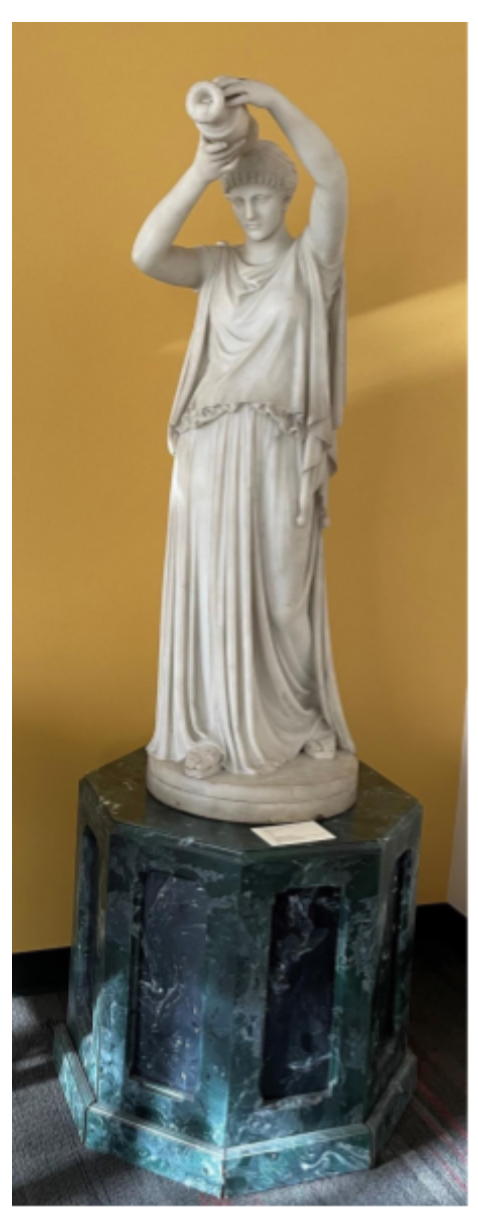
Antigone by William Henry Rinehart