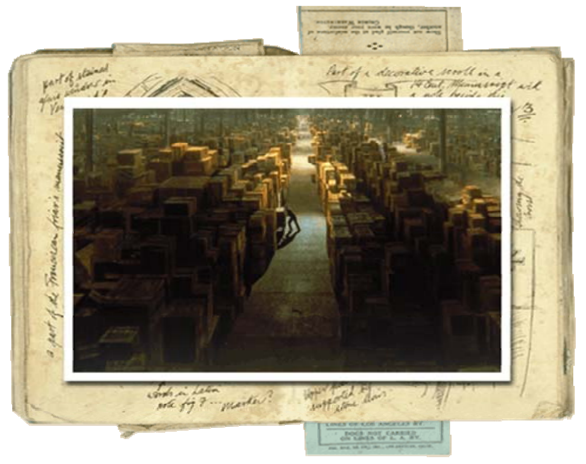
Warehouse Scene from Raiders of the Lost Ark

Permit me first to speak about the overall mission and role of the Archives. The Archives is the conscience of State government and the protector of the collective memory of our triumphs and failures as a society. On a fundamental level, the Maryland State Archives must be the repository for security copies of the records which constitute the collective memory of our world in whatever format they exist, taking care of course, not to save too much and overwhelm our capacity to evaluate and absorb the accumulated wisdom. Our role is not only to save well, but also to manage what we do save effectively. There is a final scene in Raiders of the Lost Ark (see below), which we aspire to not allowing to happen in real life. What is stored must be known and retrievable, not simply lost in a cavernous warehouse somewhere.