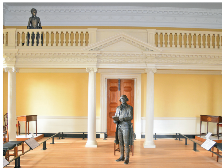
The Old Senate Chamber with bronze statues of George Washington and Molly Ridout

The arrangement of the furniture reflects the way the room looked on December 23, 1783 according to carefully researched protocols for important Congressional events in the late 18th century. Washington is shown facing the dais