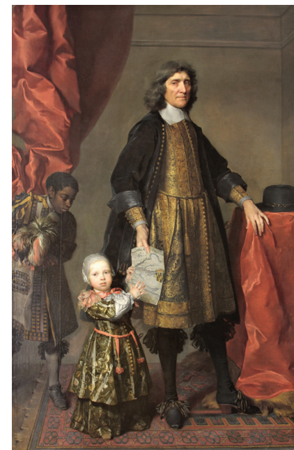
The Second Lord Baltimore Cecilius (Cecil) Calvert

In the rotunda and on the grand staircase are 17th and 18th-century full-length portraits of the Calverts. These portraits portray an entire dynasty of colonial proprietors, the Barons (or Lords) of Baltimore, and bring to life the earliest history of Maryland. The family owned the Colony of Maryland under a charter that conveyed one of the most extensive grants of powers conceded by the crown of England during America's period of colonization. Its proprietary rule ended with the American Revolution in 1776.