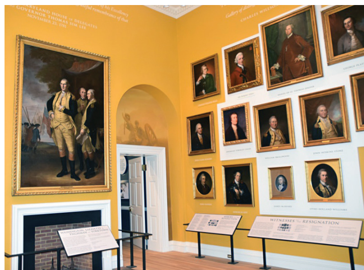
The Senate Committee Room

Two very important historical portraits are featured in these three spaces: William Pitt over the fireplace in the Old Senate Chamber and Washington, Lafayette and Tilghman at Yorktown in the Committee Room. Both were painted by renowned Maryland artist Charles Willson Peale and have hung in the State House since the 18th century.