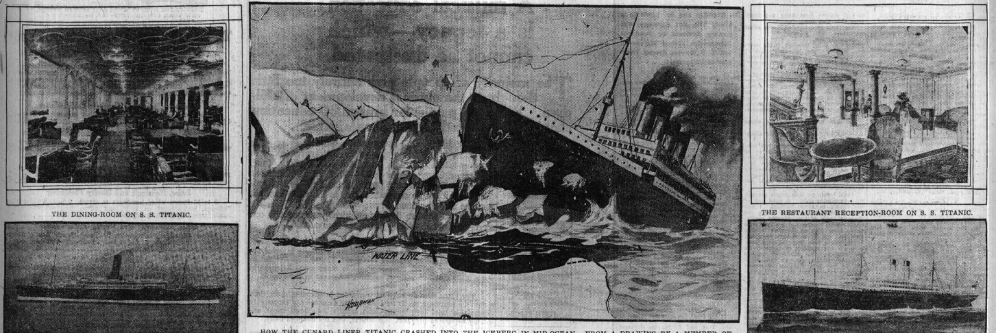
THE DINING-ROOM ON S. S. TITANIC.